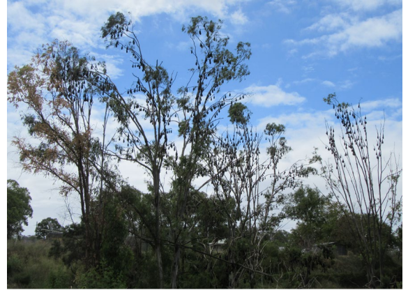
Image – Local flying fox colony roosting near Lowood bend

The colony of flying foxes, which normally inhabits the trees next to the old Lowood sewage treatment plant, has relocated for the cooler months. This is great news and ensures our construction won't disturb them. However, should they return during construction their wellbeing is our main concern. We will have a qualified Bat-Spotter on-site at all times to monitor their safety and wellbeing.