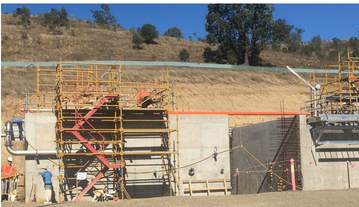
Image – The membrane tank and the bioreactor will soon be connected to form the largest structure in the treatment process (July 2020).