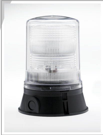
Moflash X500/501 Beacon Series

The X500/X501 range of xenon beacons has been designed for wider area signalling requirements or for applications with high ambient lighting.