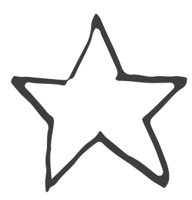
I tell my Parents/ Teacher when I see a dripping or leaking tap

If you would like to find out more ways to save water with your family, check out our 'How low can you go' challenge on our website at urbanutilities.com.au